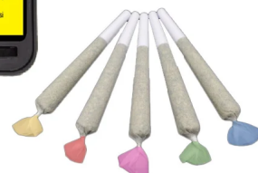
Legacy Island Grown - Variety