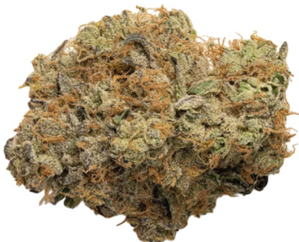
Fleurs De Lise - Medellin

0.5gx2 - Available at 22nd Street and Prince Albert.